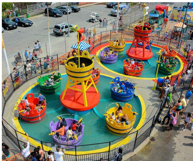
A Watermania ride (This image is included for illustration purposes only and is not a picture of the ride referred to in this technical bulletin).