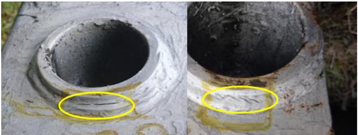
Intermediate lower A-Frame pin circular bore cracking. (visual & mpi)