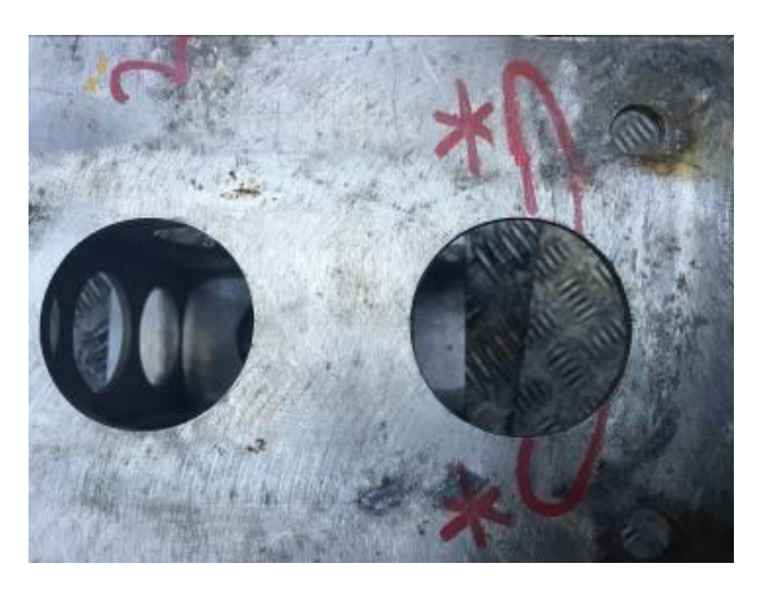
Cracking on the rear of the bracket found visually