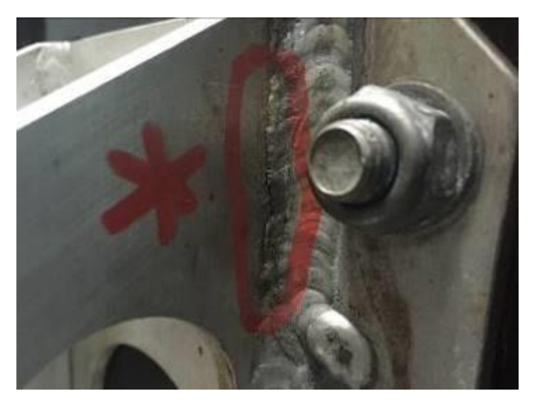
Cracking on a vertical weld – found by DPI