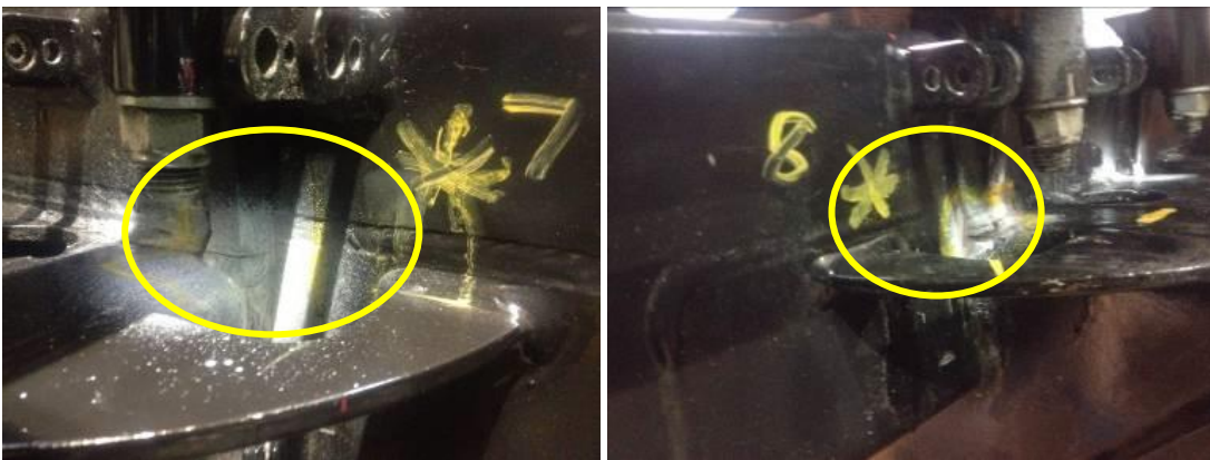
Strengthening gusset cracking below seat