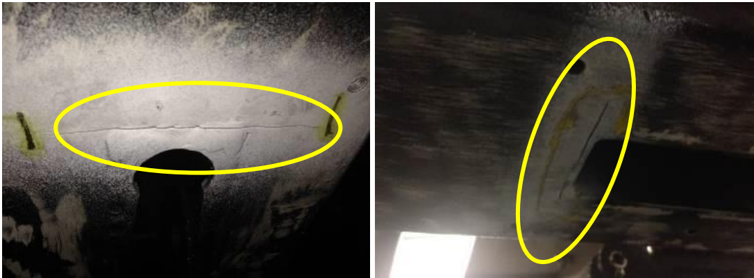
Drive plate area