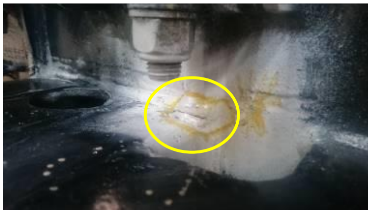
Strengthening gusset cracking below seat