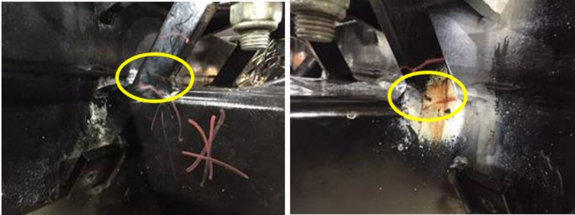
The strengthening arms between the seat frame and chassis

An area of cracking was found next to where the magnetic brake is fixed to the chassis (see following three images)