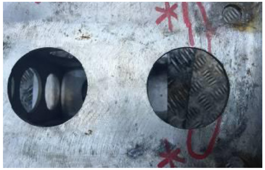
Cracking on the rear of the bracket found visually