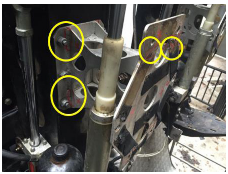
Bracket installed on the Kart